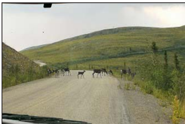
Traffic issues on the Taylor - caribou rush hour