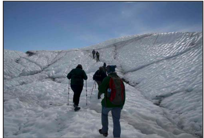
Climb'em before they're gone --The Mat Glacier